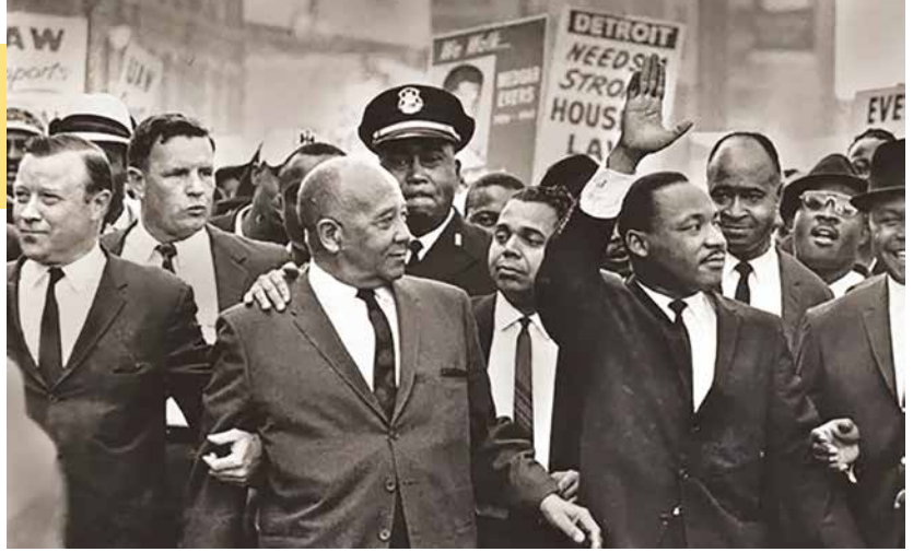
(L-R) UAW President Walter Reuther, Rev. C.L. Franklin and Dr. Martin Luther King, Jr. at the March on Washington, D.C.

The need for an open housing ordinance, a law that would prohibit people from refusing to sell homes to someone because of the color of their skin, became a big issue. When the city commission refused to pass it, the mayor resigned in protest