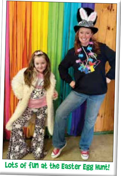
Lots of fun at the Easter Egg Hunt!