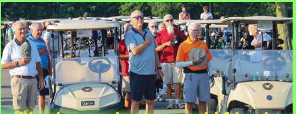
It's always nice to see old friends.