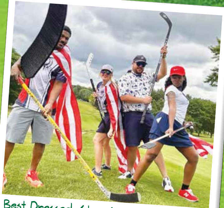
Best Dressed: Star Spangled Shankers