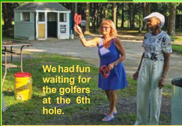
We had fun waiting for the golfers at the 6th hole.