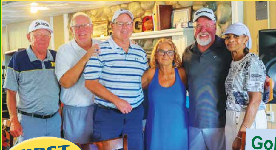
FIRST PLACE WINNERS